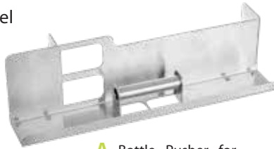
A Bottle Pusher for templates C, D & H