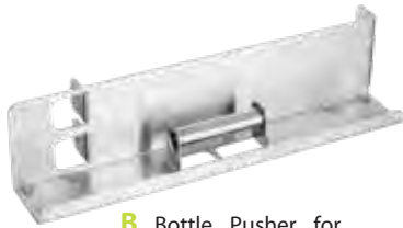
B Bottle Pusher for templates E, F, G & I